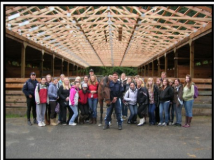
THOMAS HANEY EQUESTRIAN ACADEMY

Equine Studies 10 Equine Studies 11 Equine Studies 12 Independent Directed Equine Studies 12